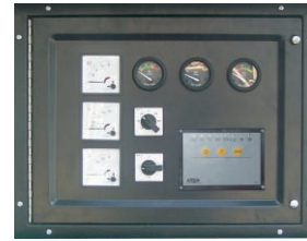
The controller made in UK DEEPSEA genset controller