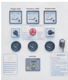
The controller made in UK DEEPSEA genset controller