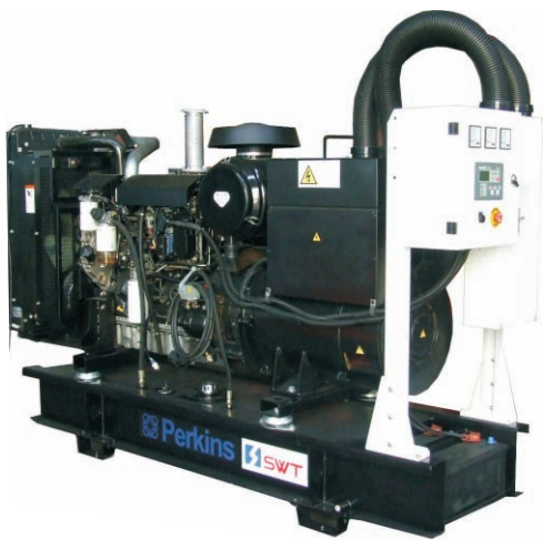
The picture only forreference