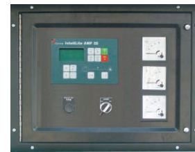
The controller made in Czech Comap genset controller