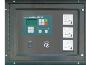
The controller made in Turkey Comap genset controller