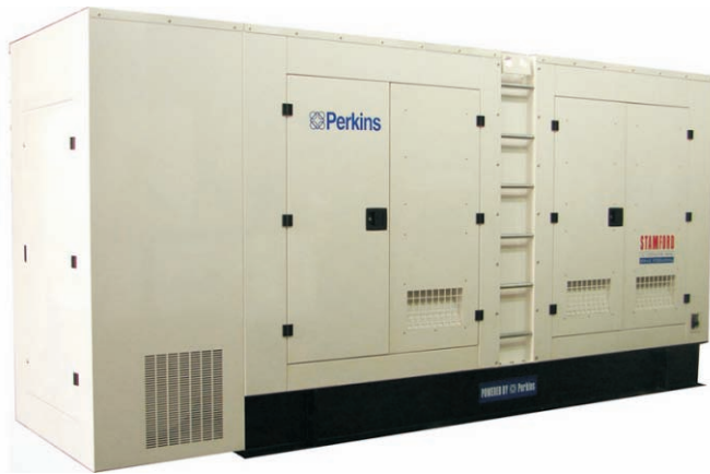
The picture only for reference