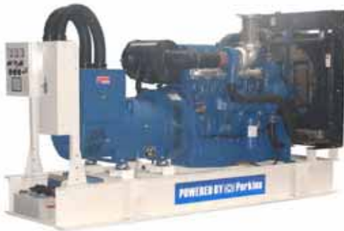
The picture only for reference