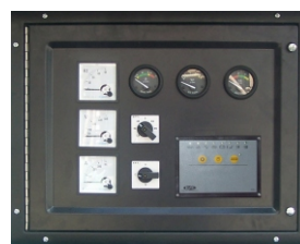
The controller made in UK DEEPSEA genset controller