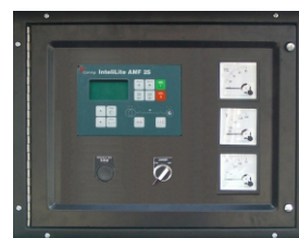
The controller made in Turkey Comap genset controller