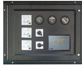
Control panel for soundproof

The DSE704 is an Automatic Mains Failure module with generator monitoring, protection and start facilities. It utilises advanced surface mount construction techniques to provide a compact yet highly specified module. This model can start the unit automatically when the MAINS failure and then control the ATS turn to the genset side. Operation of the module is via three pushbuttons mounted on the front panel with STOP, MANUAL and AUTO positions.