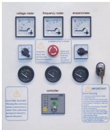
Control panel for open style

The Model 702 is a Manual Engine Control Module designed to control the engine via a key switch and pushbuttons on the front panel. The module is used to start and stop the engine and indicate fault conditions, automatically shutting down the engine and indicating the engine failure by LED, giving true, first up fault annunciation.