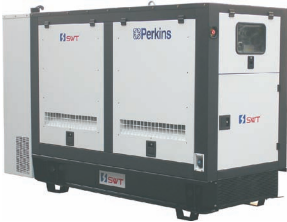
The picture only forreference